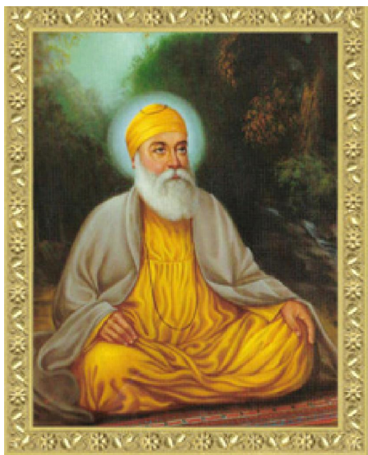
Sri Guru Nanak Dev Ji

In Gurmukhi, Devnagri and Roman Script with translation and commentary in English of Japji Sahib, Jaap Sahib, Tavprasaad Swayas, Chaupai, Anand Sahib, Assa Di Vaar, Rehras and Kirtan Sohila